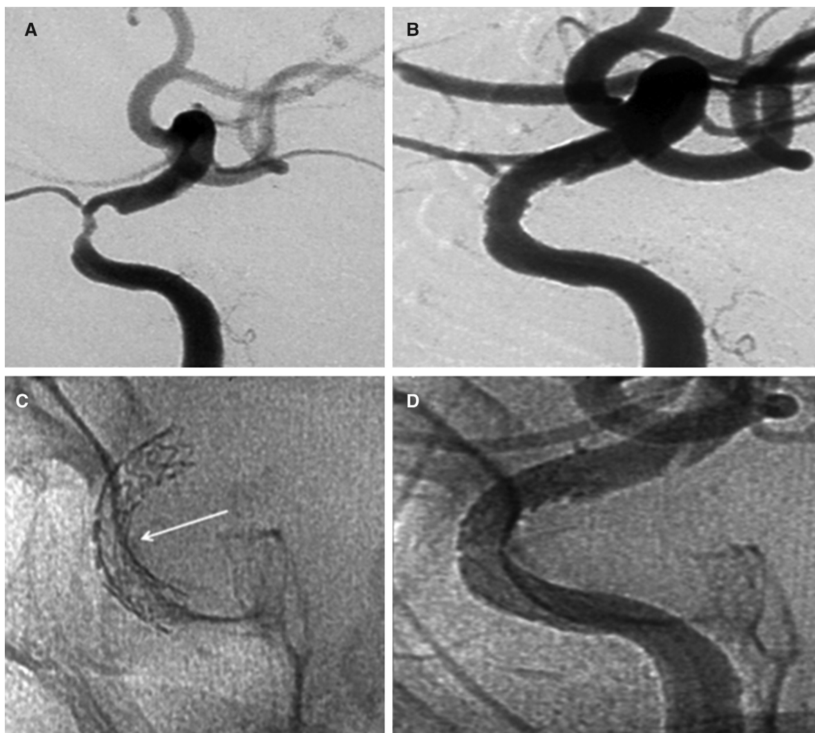
Figure 1. A 40-year-old woman presented with right-sided upper limb weakness. Digital subtraction angiogram showing >70\% stenosis of the left cavernous ICA segment (A). Endeavor drug-eluting stent was placed across the lesion, and poststent angiogram (B) showed resolution of the stenosis. Control angiogram (C, D) showed patent stent and good antegrade flow through the stent distally.

The incidence of periprocedural (1 month) complications was 12 of 19 (63.15%) in the first half of our study period (April 2004 to April 2008) and 7 of 19 (36.85%) in the second half (May 2008 to May 2012). The 1-month complication rate in anterior circulation lesions was 8.62% (10 complications in 116 lesions stented), and in posterior circulation lesions, it was 11.39% (9 complications in 79 lesions stented). The incidence of perforator territory stroke was maximum in the basilar artery lesions (4 strokes of the 39 lesions stented; ie, 10.25%). Only 1 perforator territory stroke occurred in all the other lesions put together (1 of the 156 lesions stented; ie, 0.56%).